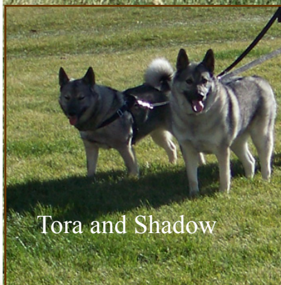
Tora and Shadow