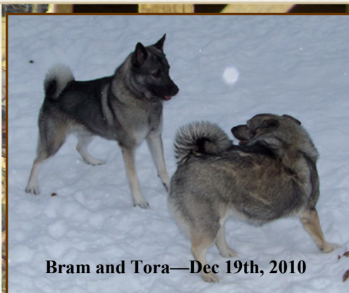
Bram and Tora—Dec 19th, 2010